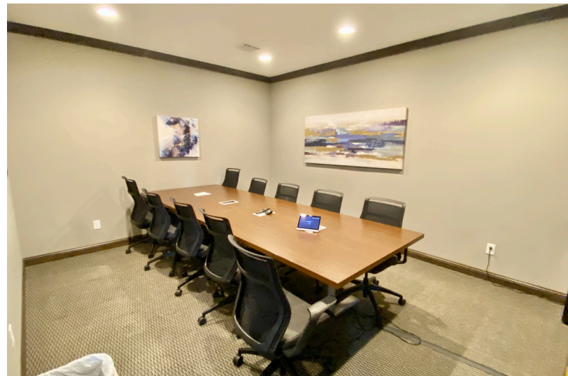
Example of build-out