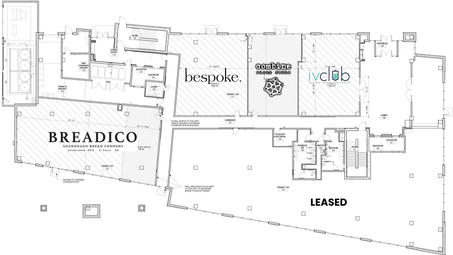
1 01 - FIRST FLOOR 1/8" = 1'-0"