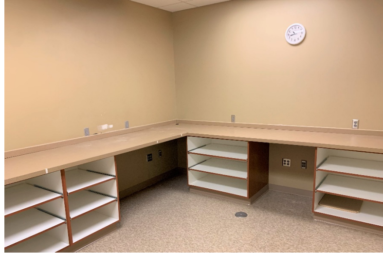
Shared Main Level Conference Room